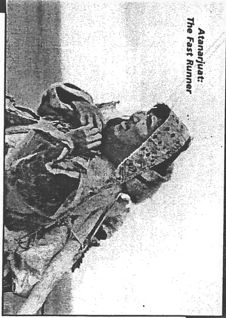
Atanarjuat: The Fast Runner